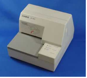
<UP-360 and SP-1300 printer>