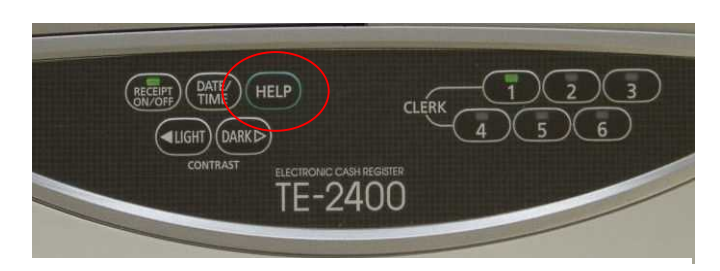
<Location of HELP key on the TE-2400 model>

Furthermore, these messages are customizable to meet individual needs.